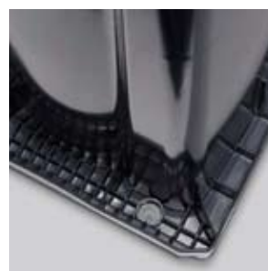
Sturdy comb lift