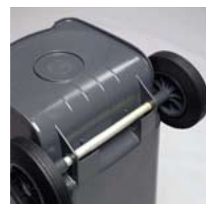
Reinforced axle housing